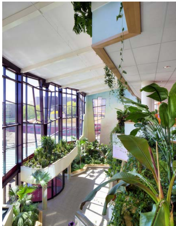
"Isala" Hospital in Zwolle (NL)

Alberts & Van Huut International Architects in collaboration with Aan de Amstel Architects